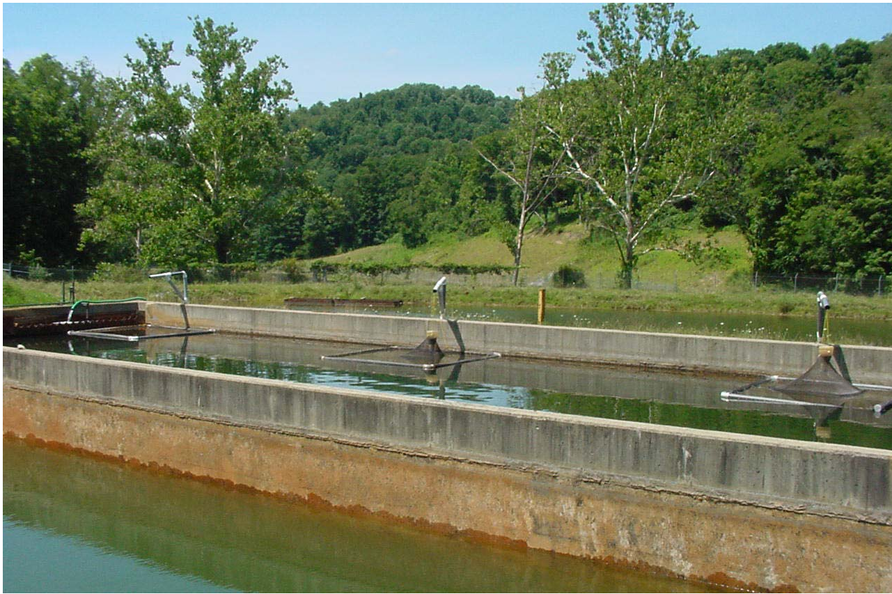
Old AMD plan for Tygart River Mine: Stocked with 3 warm water species Infrastructure: elec./road/fenced/3 ponds/ 2x100,000 gal. basins