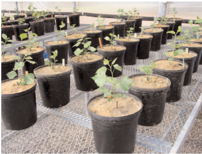
Hybrid poplar pot studies using various soil amendments.

Researchers then developed a leachate column methodology to simulate field conditions at the NMSU Agricultural Science Center Farmington site. They filled soil columns to a uniform bulk density of 1.5–1.6 g/g and applied CCBs as amendments to the tops of the columns. Researchers are conducting artificial rain/irrigation applications to simulate a worse case scenario during a typical six-month crop growing season.